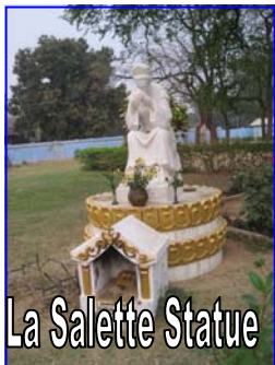
La Salette Statue

La Salette volunteers and aspirants are going to have their initial formation. The volunteers stay here and help out at the shrine works. The MS formation starts from volunteer program, later to move on to aspirancy. By this, they get to know La Salette and the community.