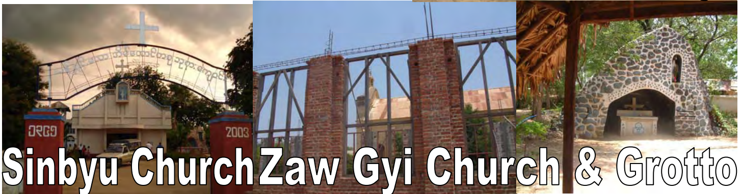
Sinbyu Church Zaw Gyi Church & Grotto