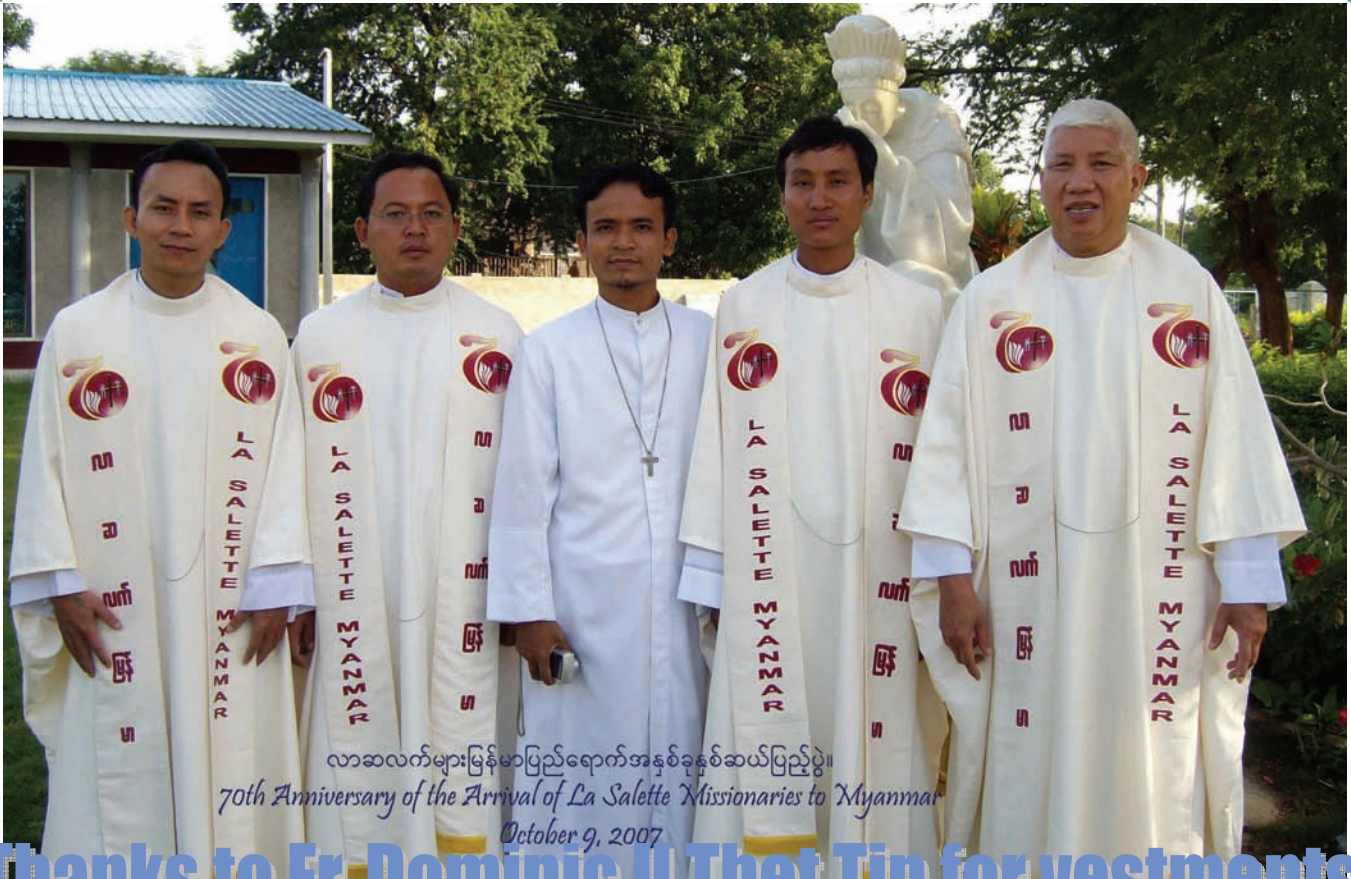
လာဆလက်များမြန်မာပြည်ရောက်အနှစ်ခုနှစ်ဆယ်ပြည့်ပွဲ။ 70th Anniversary of the Arrival of La Salette Missionaries to Myanmar October 9, 2007