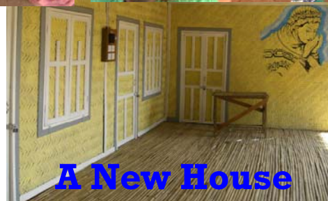
A New House