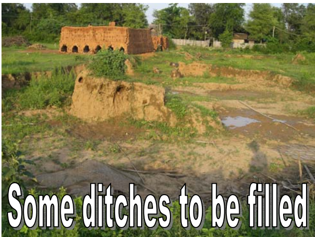
Some ditches to be filled