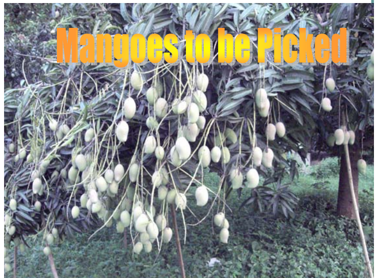
Mangoes to be Picked