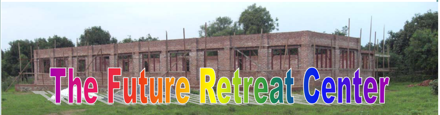
The Future Retreat Center