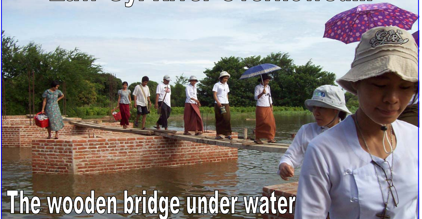
The wooden bridge under water