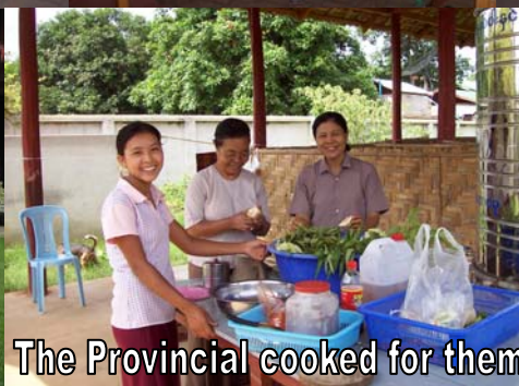
The Provincial cooked for them