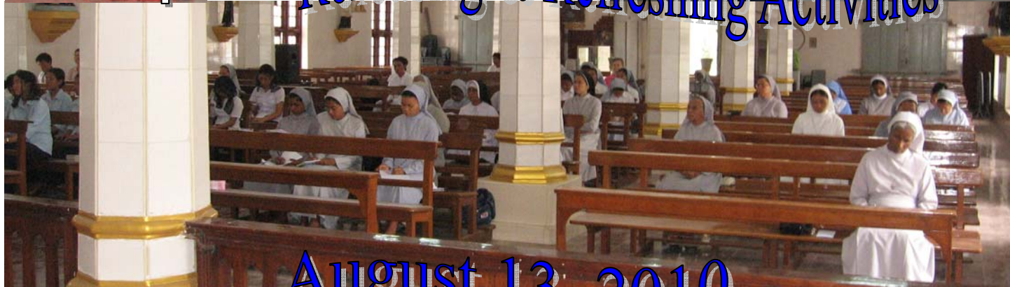
August 13, 2010