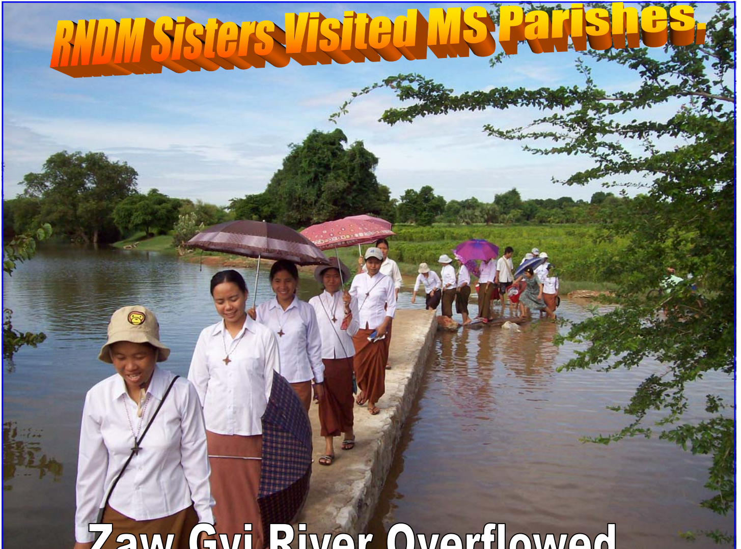
Zaw Gyi River Overflowed...