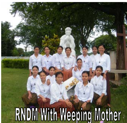
RNDM With Weeping Mother