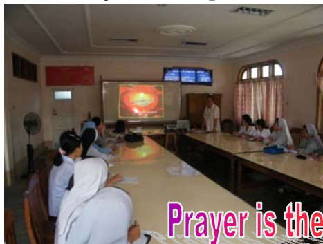
An Hour & Half Talk