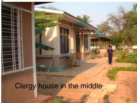
Clergy house in the middle