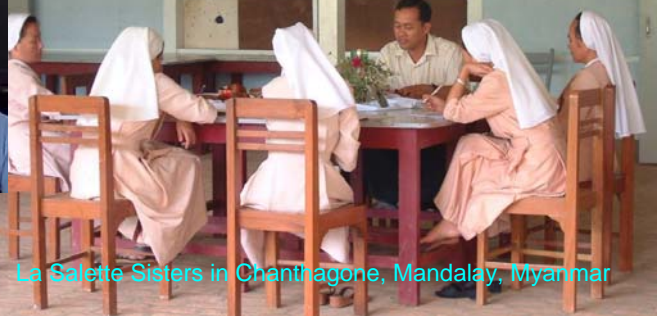
La Salette Sisters in Chanthagone, Mandalay, Myanmar