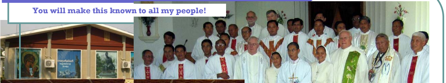
La Salettes Missionaries

You will make this known to all my people!