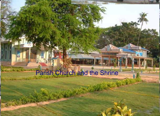
Parish Church and the Shrine